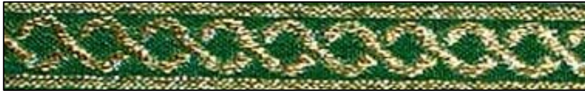
Dark Green 670