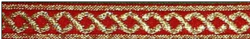
Light Red 673