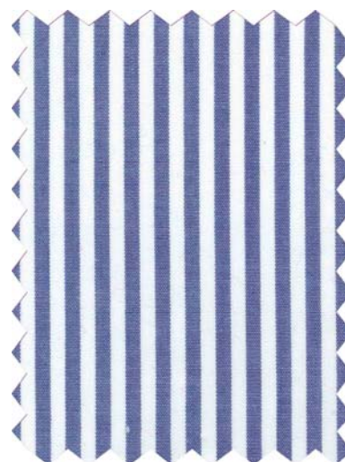
Blue Medium 9009