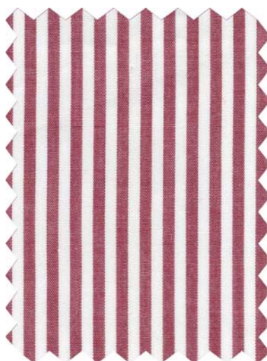
Wine Medium 9010